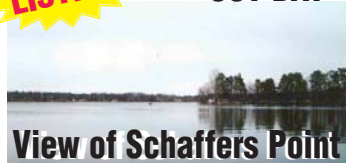
View of Schaffers Point

This is a once in a lifetime chance! 1 plus acre, 100'x316' x 240'x284' Lot #1 Gullwood Estates Call Mark Engstrand today...218-330-1240 Go to www.markengstrand.com