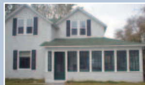
MLS 142800 $119,900

This property is located off of Co Rd #1. A quality well maintained home on 2.5 ac. LL just completed w/T&G pine. Great hunting & recreational property close to Pequot, Jenkins, & Pine River.