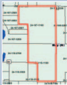
MLS 142939 $2,870,000 957 ACRES MOTLEY

116 acres of up north property! Hunting & recreational property with Prairie River winding through property. Canoe, fish, hunt, & much more on this property!