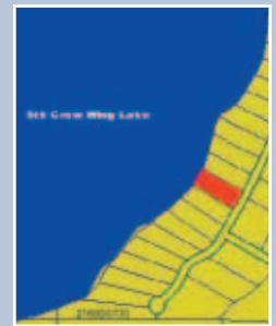
MLS 140193 $154,900 6TH CROW WING LAKE, NEVIS

This property is a mix of fields and woods, high and some low land. Absolutely great hunting! Nice building site. Hard to find this kind of property!