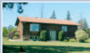
MLS 140593 $139,900

Brand new 4BR, 3BA home on 10 ac. 2880 SF. Beautiful wood floors in kit., DR, FR & GR. Kit. features custom maple cabinets. Stunning see-through gas FP between DR & GR. MBR has private BA. 12x12 covered deck w/vaulted ceiling.