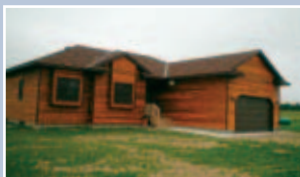
MLS 140933 $299,900

Beautiful wooded lake lot, 165 feet of lakeshore on 6th Crow Wing Lake. 1.27 acres. River access to 5th & 7th Crow Wing Lakes. You have access to over 700 acres of lake! A true up-north lake property!