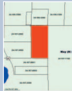
MLS 142759 $239,900 80 ACRES - MOTLEY

Developers, ranchers & hunters! This property has everything you would want! 957 ac. of fields & woods. Mosquito Creek runs through property. Property is fenced & has guest house & outbuildings. A must see! *Home & 10 ac. are excluded.