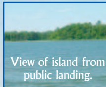
View of island from public landing.