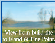
View from build site to island & Pine Point.