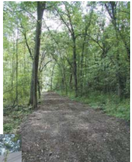
Beautiful walking path just steps away from your new home.