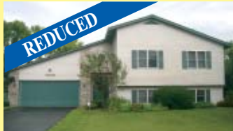
1804 Slater Lane Burnsville • $259,900

3 BR, 3 BA, 3 car garage, vaulted 4 lvl-split, master suite with full bath & WI closet. Pond view, walk out with patio!