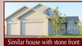
Similar house with stone front

Lic. #20435686 Builder/Broker www.NEWDIMENSIONHOMESINC.com