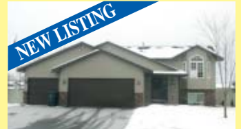
4978 Michelle Rd, Big Lake • $214,900

4 BR, 4 BA, 3 car, deck, HD, tile, see-thru FP, irrigation, plus more.