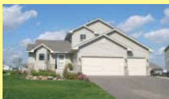
3811 Hayward Ct. Monticello • $279,900

Gorgeous landscaping, 4 BR, 3 BA, 3 car gar., deck, patio, walk out, finished bsmt, pond view, HW floors, raised panel oak cabinets, center island, vaulted! Squeaky clean, better than new!