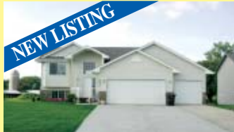
5593 Aberdeen Way, Big Lake • $209,900

4 BR, 2 BA, 2 car gar, plus office. Perfect location, clean as a whistle! New carpet, fresh paint, well maintained. Tile, HW, fenced yard. Near park and shopping.