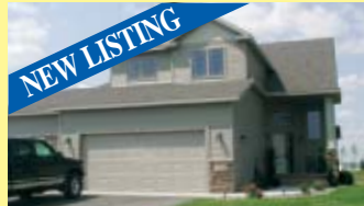
1624 Grace Drive, Big Lake • $329,900

4 BR, 2 BA, 3 car, cedar front porch, irrigation, walkout, on trails and pond.