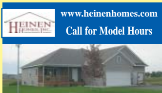
18935 Helen Way Big Lake • $259,900

Gorgeous landscaping, 4 BR, 3 BA, 3 car gar., deck, patio, walk out, finished bsmt, pond view, HW floors, raised panel oak cabinets, center island, vaulted! Squeaky clean, better than new!