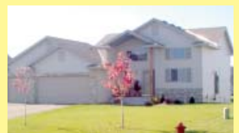
9599 Park Place Dr., Monticello • $242,900

2 BR, 2 BA, 2 car gar. plus loft, large master w/ceiling fan & fantastic WIC, maple kit. floors & kit. cabinets, front patio plus more. Convenient location near shopping & easy commute.