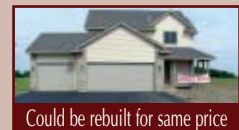
Could be rebuilt for same price

4 BR 3 BA oversized 3-stall gar. Upper level ldr with 4 BR on one level. 10 ft MF with vaulted owners suite. Lg front porch & 6-panel doors throughout. Custom Oak Cabinets & entertainment center. FP & sod into price. Hurry to pick colors.