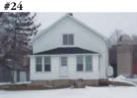
#24 BUFFALO $319,999