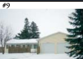
#9 ANNANDALE $221,000