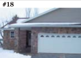
#18 HOWARD LAKE $334,900