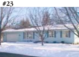
#23 BUFFALO $193,000