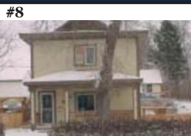
#8 BUFFALO $172,900