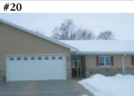
#20 HOWARD LAKE $202,900