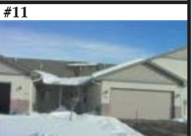
#11 MAPLE LAKE $158,900