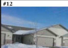
#12 MAPLE LAKE $155,900