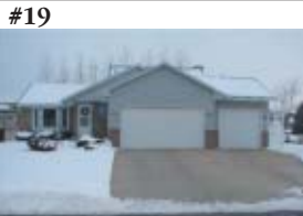
#19 MAPLE GROVE $299,900