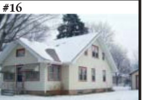
#16 HOWARD LAKE $164,900