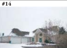
#14 BUFFALO $915,000