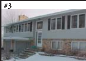
#3 DAYTON $349,000