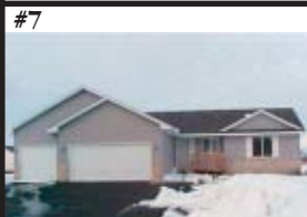
#7 WAVERLY $204,900