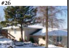
#26 MAPLE LAKE $439,000