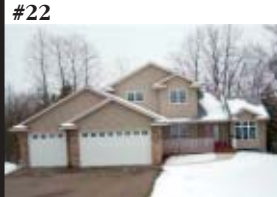
#22 ROCKFORD $438,500