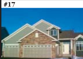
#17 HANOVER $324,900