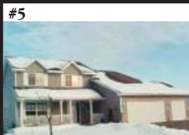
#5 MONTROSE $249,750