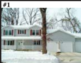
#1 HUTCHINSON $349,900