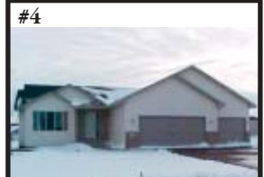
#4 WAVERLY $199,900