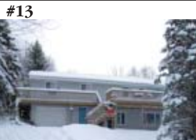
#13 MAPLE LAKE $164,900