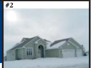
#2 BUFFALO $279,900