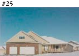
#25 BUFFALO $284,900