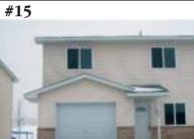
#15 MAPLE LAKE $152,500