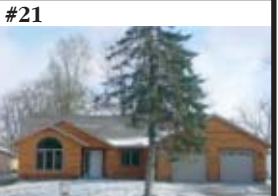
#21 ANNANDALE $225,000