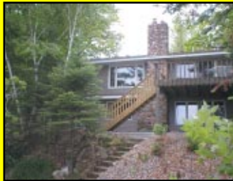
WOMAN LAKE $399,000

Spectacular 2+ acre property has 500+ ft lakeshore & very private home that includes 3 BR, 3 bath, study, spa, skylights, huge screened porch, & expansive deck!