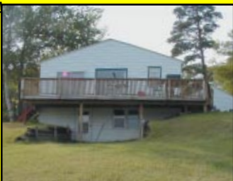
LAKE LOUISE $144,900

Enjoy great privacy at this 3 BR, 2 bath WO surrounded by towering pines on over 2 acres! The level lakeside area is great for relaxing & sandy swimming.