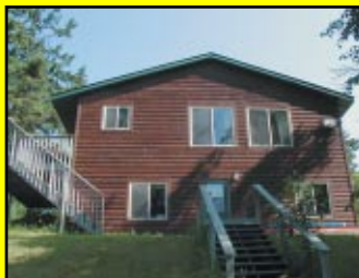
GIRL LAKE $299,000

Cute 2 BR, year-round cabin gives you plenty of room for family, friends, and all your toys. Property includes 24x26 garage, 20x20 bunk house, and 11x16 storage shed.