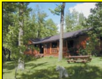
BOY LAKE $295,000

Spacious year-round, 4 BR, 2 bath lake home includes a 2 BR, 1 bath seasonal guest cabin that sits close to the water's edge of Girl Lake.