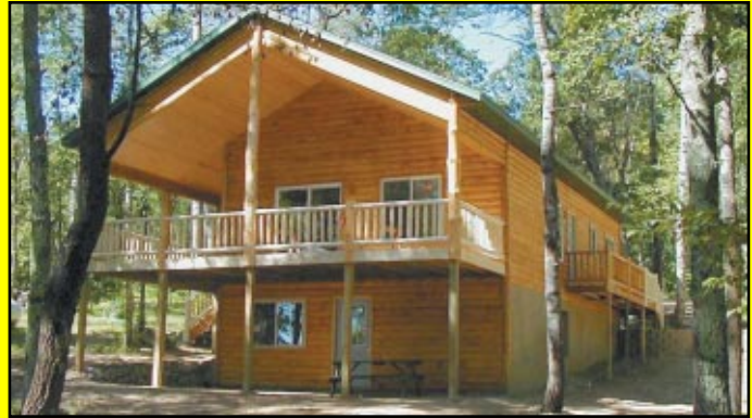
OX YOKE LAKE $229,000

You'll love the complete privacy of almost 4 acres of heavily wooded lakeshore! Property has 242 ft of level lakeshore, 2 BR main cabin close to the water's edge, & 2 BR guest cabin w/ great lake views!