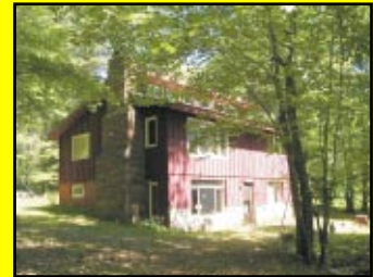
BASS LAKE $249,900

Spacious 3,600 SF lake home has large rooms and great lake views from virtually every room, including all 4 BRs. Att. 2-car garage includes a htd. workshop.