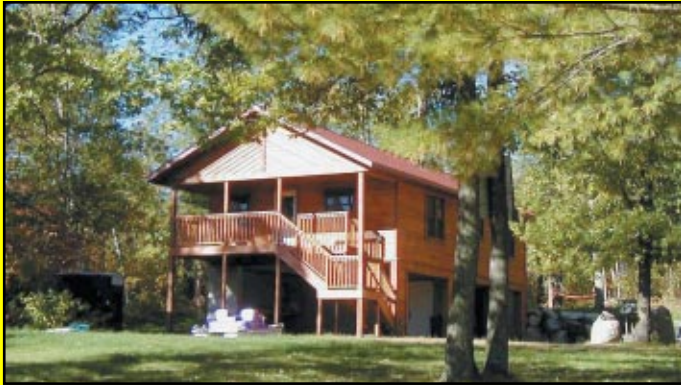
HORSESHOE LAKE $349,000

You'll love the complete privacy of almost 4 acres of heavily wooded lakeshore! Property has 242 ft of level lakeshore, 2 BR main cabin close to the water's edge, & 2 BR guest cabin w/ great lake views!