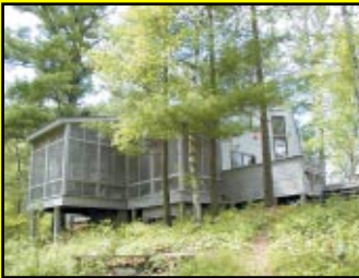
BARNUM LAKE $377,000

Brand-new year round cabin w/ open floor plan, vaulted ceilings, and covered porch facing the lake sits on a gorgeous level wooded lot w/ a gentle slope to water's edge!