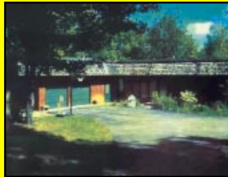
WOMAN LAKE CHAIN $327,200

Charming 4 BR, 2 bath walkout has been remodeled inside and out! Large lake-facing views give you a million $$ view of Bungy Bay! Garage & workshop.